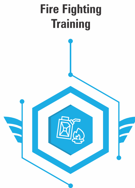
Fire Fighting Training