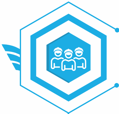
Quick Response Team