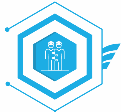
Night Checking Squad